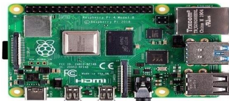
Figure 1. Image of raspberry pi 4 module B.

The Raspberry Pi is microprocessor that can be used in many robotic projects. We are using Raspberry Pi for image and video processing as shown in Figure 1.