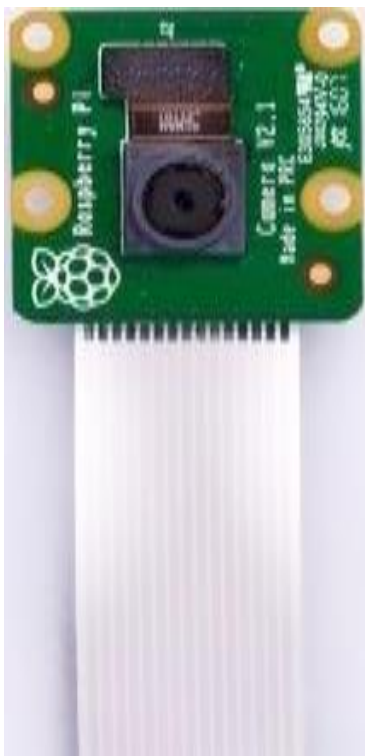
Figure 2. Figure of Raspberry pi cam.

Here we have used the pi cam as it is good for easy connection and its size is very less as compared to USB-cameras.